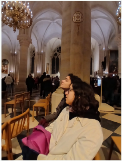
Psalm 71:15-16: "My mouth will tell of Your righteous acts, of Your deeds of salvation all the day, for their number is past my knowledge. With the mighty deeds of the Lord I will come; I will remind them of Your righteousness, Yours alone."

Dear friends and partners, we love sharing with you stories of what Jesus Christ is doing! Psalm 71 is about God's greatness and about hope in God. Many people are without hope, but many are finding hope in Jesus. Here are a few of the stories I heard at our annual Operation Transit Steering Committee meeting: